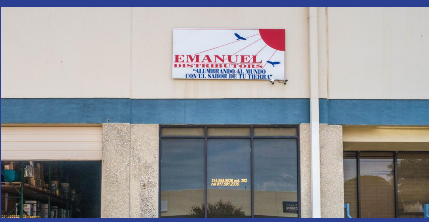
Alumbrando al Mundo con el Sabor de tu Tlerra!